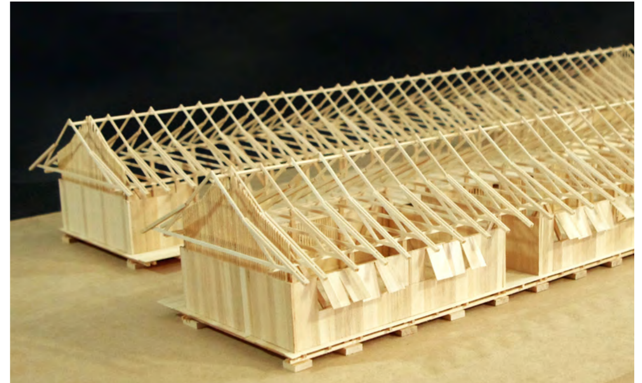
Konstruktionsmodell construction model